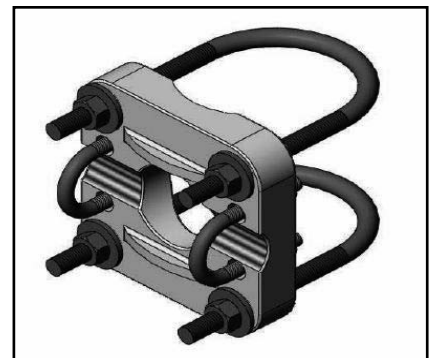
BWC1001A yagi clamp, fits mast OD of 0.75" - 1"