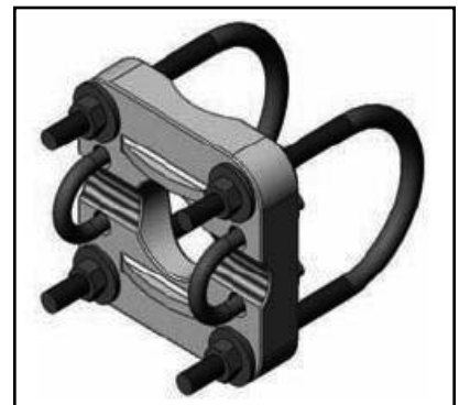
BWC1001A reversible U-bolts fit pipe mounts 1.25" - 2.4" OD